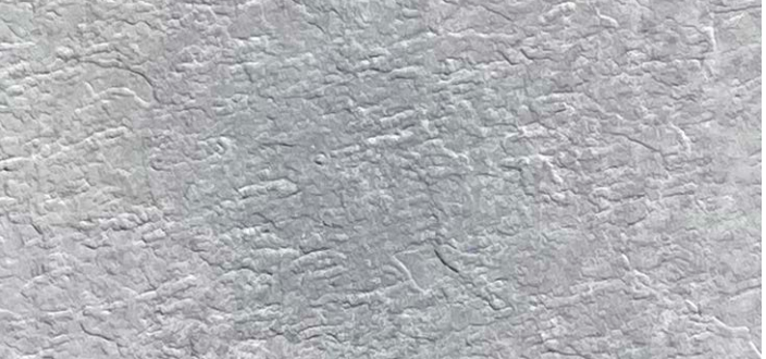
*Colours are an indication only. Always sight physical product colour samples before purchase.